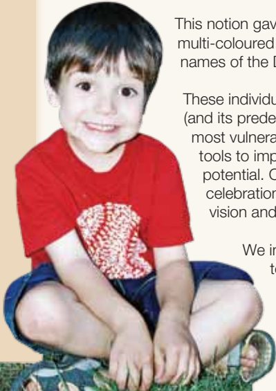
8 - Durham Children's Aid Foundation

We invite you to drop by our premises to celebrate our tribute to those whose contribution will improve the life of a child, youth or family, not just for a moment but for a lifetime.